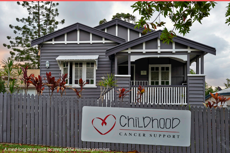
A med-long term unit located at the Herston premises.

That all regional families have equal access to accommodation and tailored family support services to help them cope when their child is diagnosed with cancer.